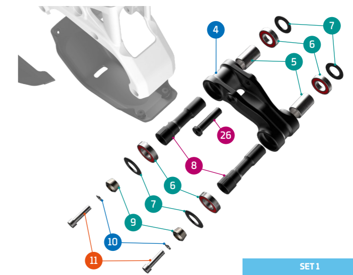
SET 1 ZERO BEARING KIT 20